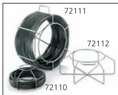
Cables sold separately