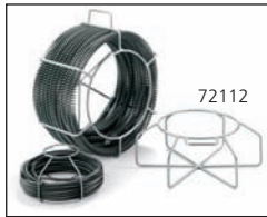
Cables sold separately 72112