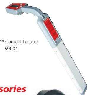
ROCAM® Camera Locator 69001