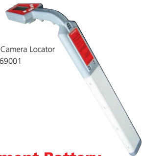
ROCAM® Camera Locator 69001